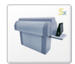
The Chromira5x is the world's fastest LED printer Learn More Now>>

expensive laser printers, it can handle high volumes of individual image files for the most efficient workflow in the world.